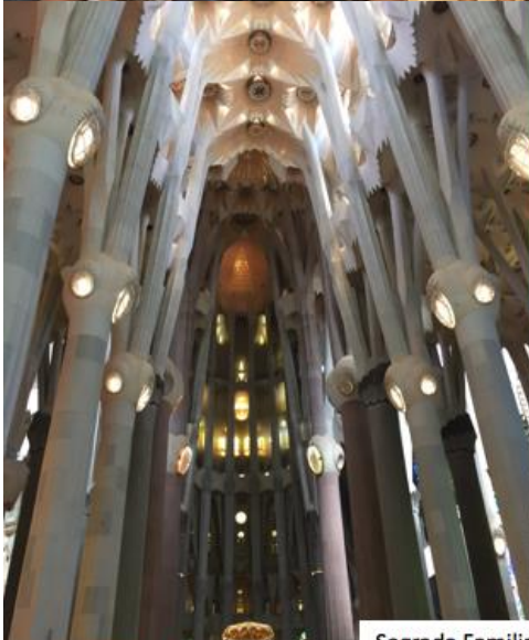
Sagrada Família, Barcelona