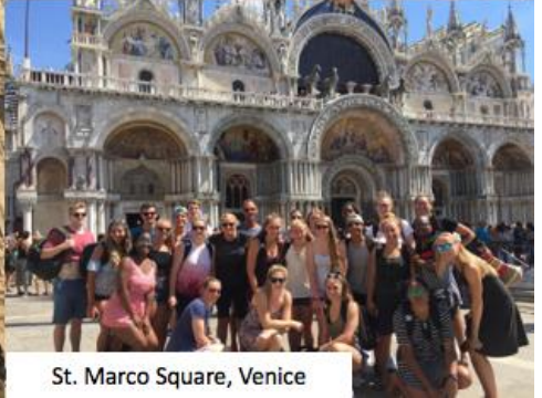
St. Marco Square, Venice