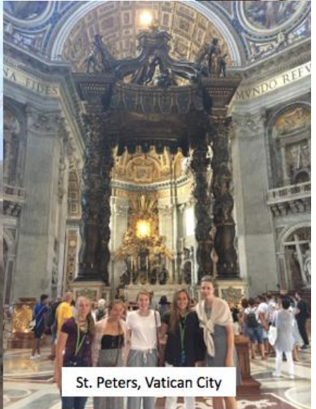
St. Peters, Vatican City