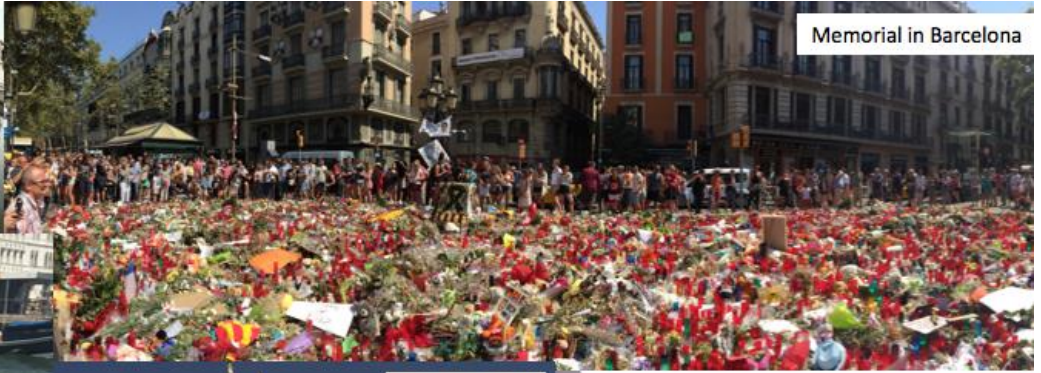
Memorial in Barcelona